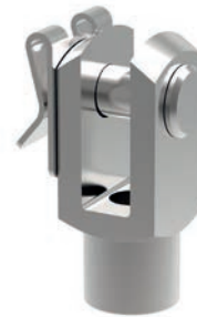
Clevis with clevis pin 65664 Safety fastener 65680