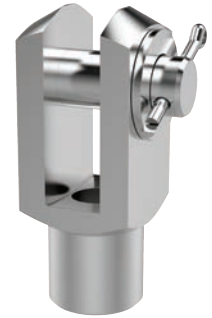
Clevis with clevis pin, washer and cotter pin 65660 and 65674