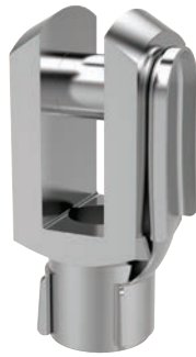
Clevis with retention clip 65630 and 65684